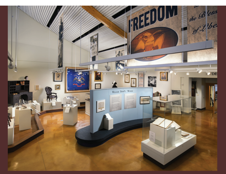
Freedom Exhibition in Groff Gallery