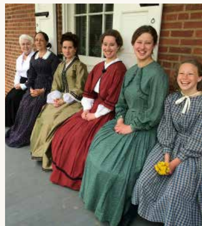
Harriet Lane reenactors.

In the last twelve months our dedicated corps of volunteers has provided 12,358 hours of service with a financial value of $278,687. LancasterHistory.org would not be able to provide the extensive roster of services it has without these friends. Thank you for giving of your time, heart, and talents!