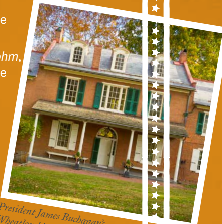
President James Buchanan's Wheatland in autumn.