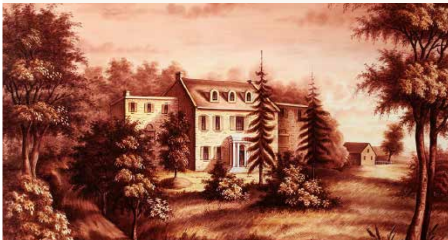
Top: Schoolchildren enjoy visiting Thaddeus Steven's home and compose original poetry for the "Poetry Paths" project. Center: The Stauffer Wing. Bottom: A new addition to the collection - a painted-glass depiction of Wheatland used to decorate Buchanan's inaugural train car.