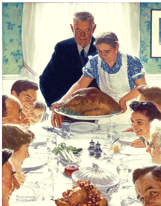
Freedom from Want by Norman Rockwell (1943)

Treat your guests to a private table for ten. You will be recognized on sponsor posters on-site at the Valentine Gala and on LancasterHistory.org's website ( www.lancasterhistory.org ).