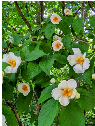
A flowering Japanese Stewartia ( Stewartia pseudocamellia ).