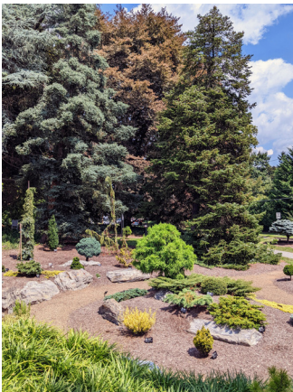
The American Conifer Society “Dwarf Conifer” Reference Garden