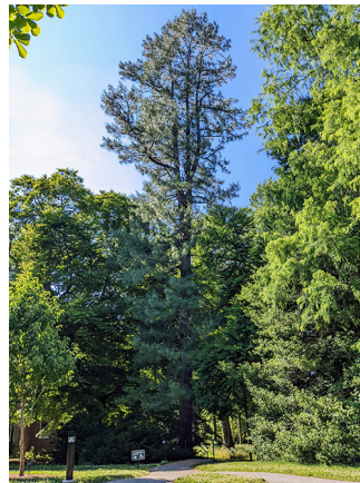
(center) Himalayan Pine ( Pinus wallichiana ), a State Champion Tree.