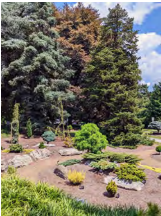
The American Conifer Society “Dwarf Conifer” Reference Garden