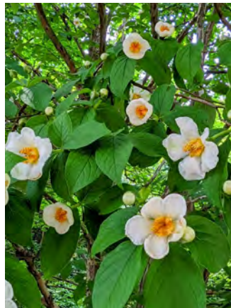
A flowering Japanese Stewartia ( Stewartia pseudocamellia ).