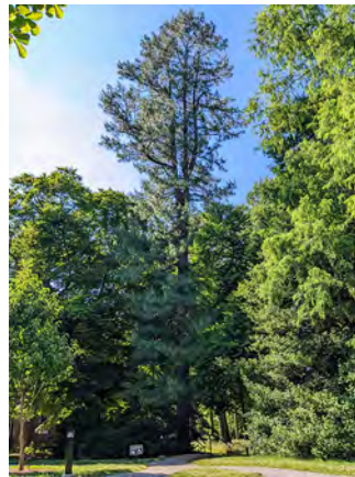
(center) Himalayan Pine ( Pinus wallichiana ), a State Champion Tree.